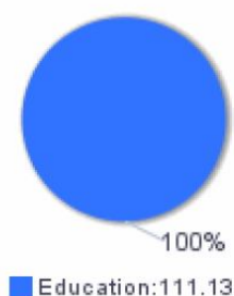
Table1: MSYs by Focus Areas